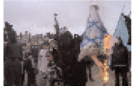
Hamas fighters burn Israeli flag

Well, it just shows that the attempt at isolating Hamas, which actually means not isolating Hamas as such, but the elected