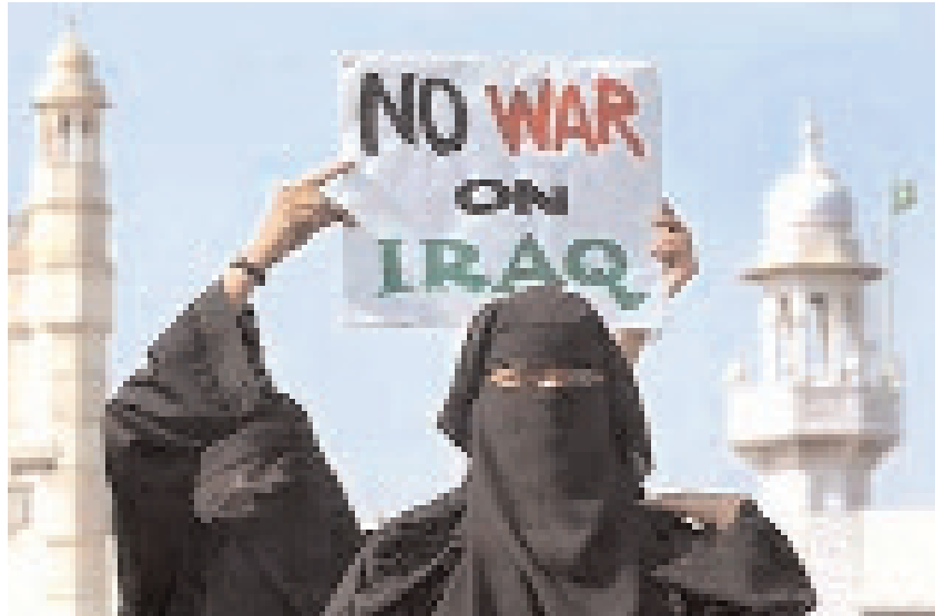
Muslim women in Mumbai demonstrate against the war

for differences and they find them most easily in religion.