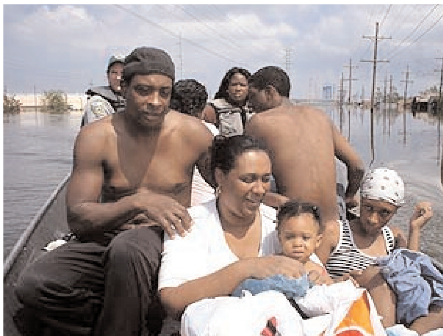
Aftermath in New Orleans

In intervening on the terrain of aid, we are obviously faced with political problems. We have already mentioned a whole series of them, at a general level: guaranteeing the independence of the campaigns in relation to states, criteria of choice of partners, the very conception of solidarity. Many other problems emerge when we find ourselves faced with concrete situations. The impact of a natural disaster in a civil war zone can, for example, be very different: unblocking of peace negotiations in Aceh, in the Indonesian archipelago, but not in Sri Lanka.