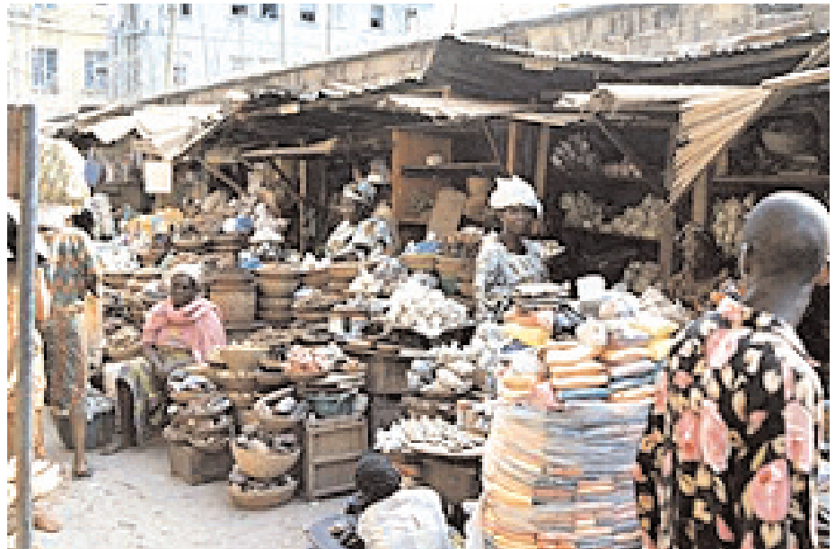
Prices of necessities go through the roof

They alone can unleash a general strike. On the other there are the multiple links (social, economic, familial, ethnic and so on) which unite wage earners with the rest of the population. Whether through overlapping between formal and informal activities [6], or membership of community groups (religious,