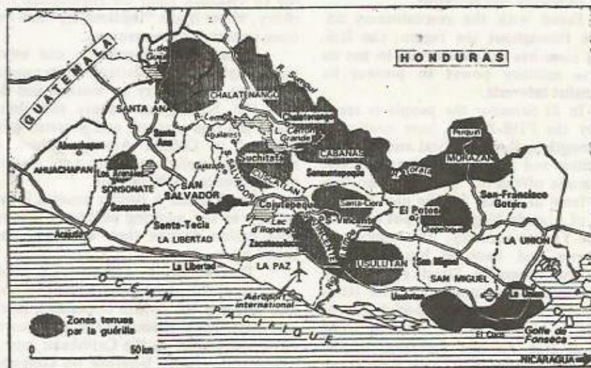
FMLN-FDR controlled areas in El Salvador.

Such understanding was undoubtedly a hard-won gain for the Salvadoran movement, and it may be difficult to sustain under the pressures of a growing war. But it does represent the development of a trend that could be seen already in the Nicaraguan revolution. It is a step toward renewing a very important aspect of the tradition of the Bolshevik party that led