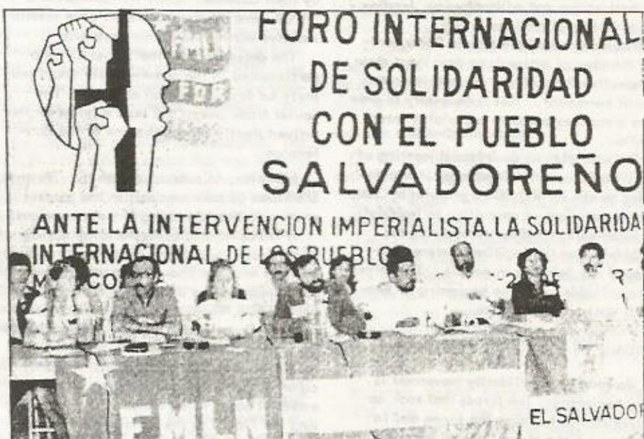
Presidium at Solidarity Forum

There were nearly two hundred contributions to the discussion, amending and improving the proposed documents. This