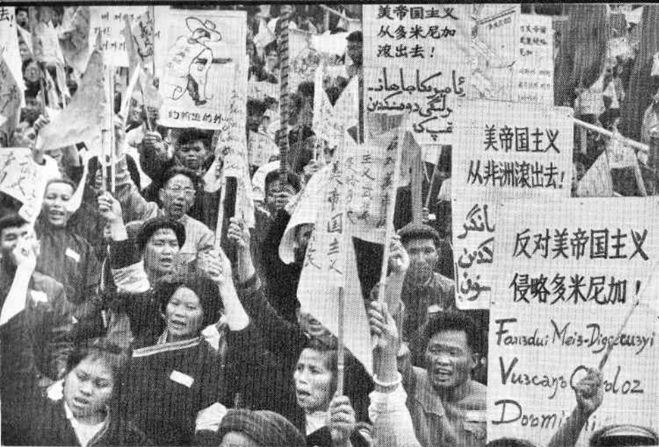
Representatives of minority nationalities visiting Peking shout: "People of the whole world, unite and overthrow U.S. imperialism!"