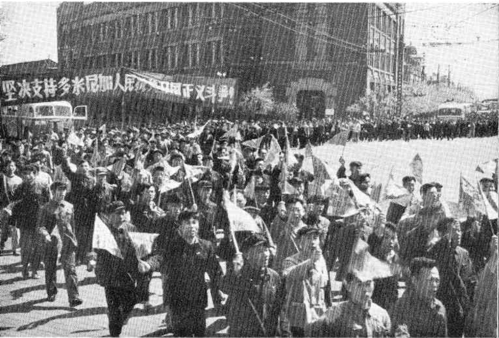
The workers of Shenyang cry: "U.S. imperialism, get out of the Dominican Republic!"