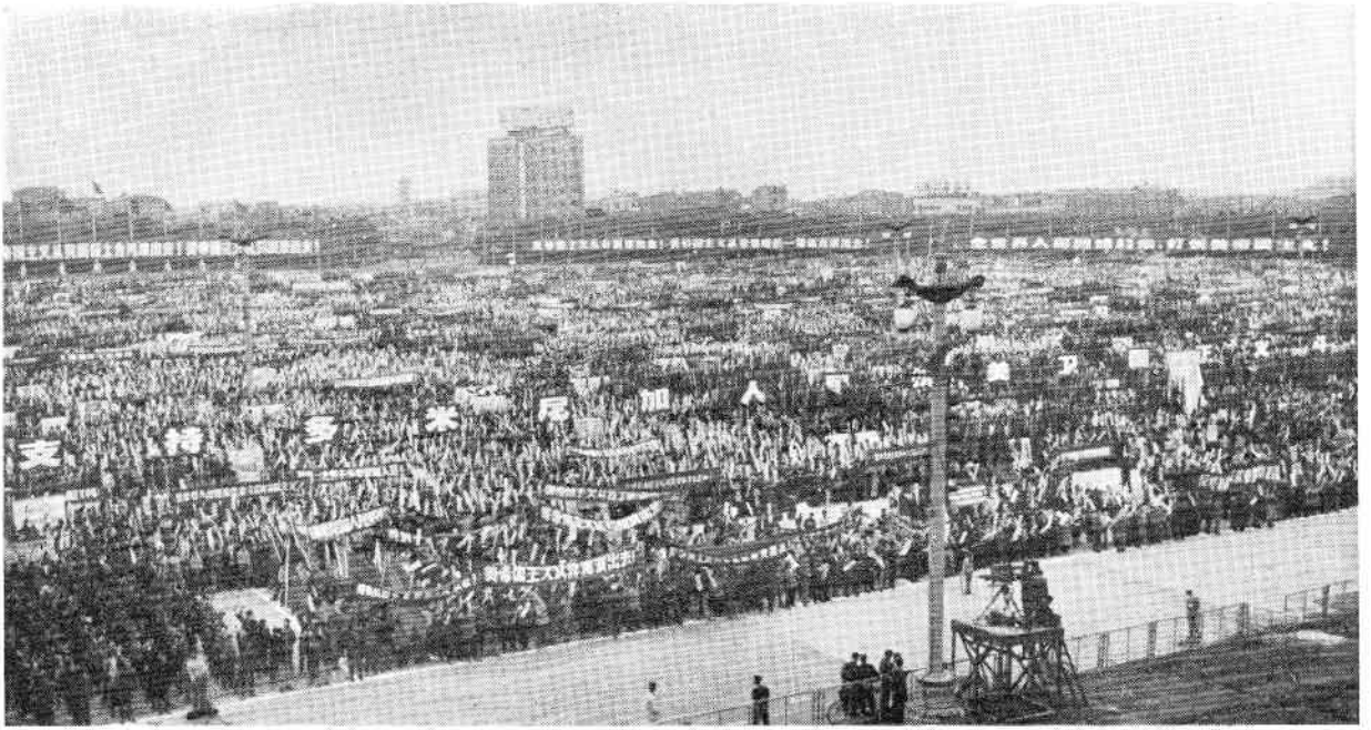
The huge rally in Shanghai in support of the Dominican people against U.S. aggression