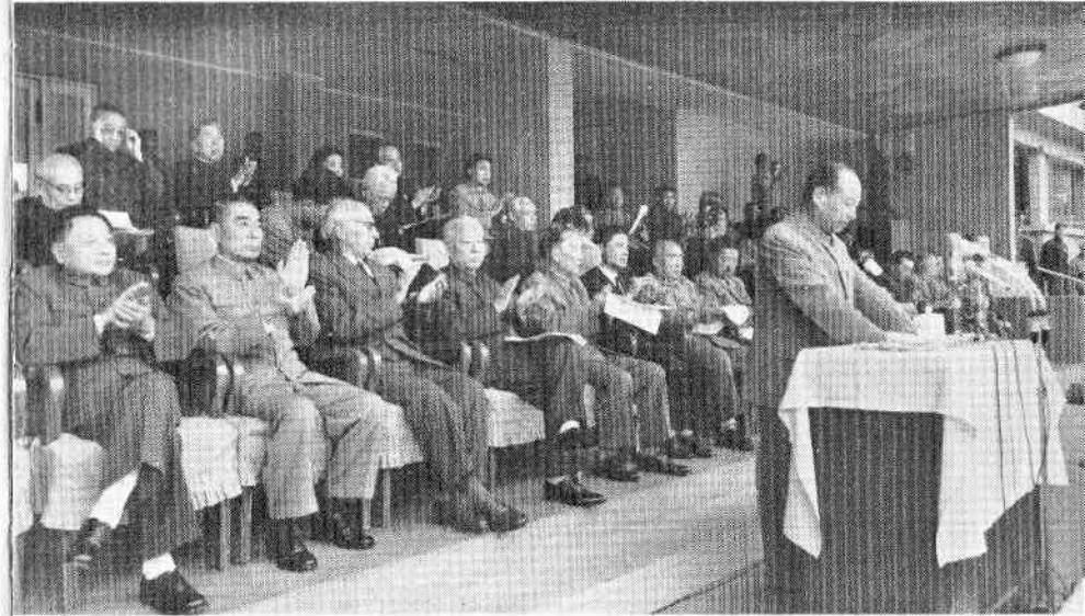
The mass meeting is addressed by Peng Chen, Member of the Political Bureau of the Central Committee of the Communist Party of China and Mayor of Peking

A mammoth mass rally was held in Peking, on May 12, 1965, in support of the Dominican people's resistance to U.S. armed aggression