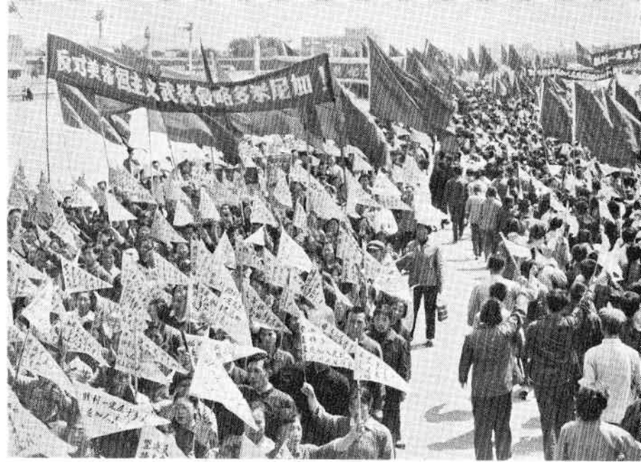
Hundreds of thousands of demonstrators march through Peking