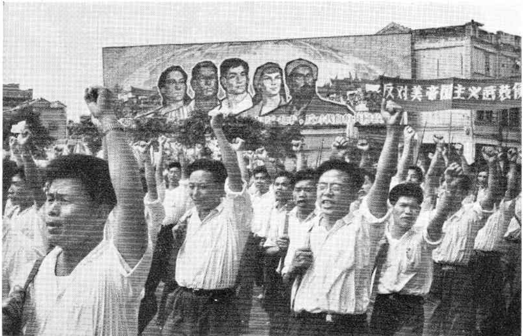
"The Dominican people will win, U.S. imperialism will be defeated!" shout the people of Canton