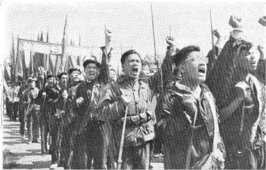
Peking militia angrily shout: "U.S. imperialism, get out of all places you have invaded!"